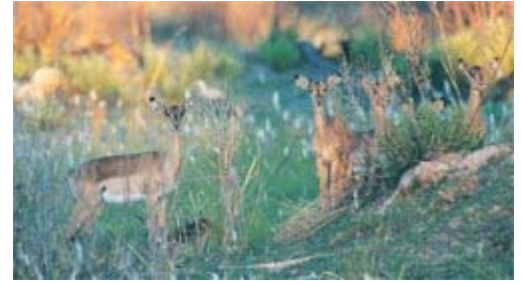
Dainty impalas such as these represent one of the major prey species for Botswana leopards. For this reason, they make excellent bait hung from an appropriate tree limb to attract a big male leopard.

In addition, you should have your rifle pre-positioned through a peephole or port so that your movement is minimal when the guide silently signals you to get ready to shoot. (You must also be sure not to awaken the official Botswana game scout, who usually falls asleep within seconds of getting into the blind with you and your guide).